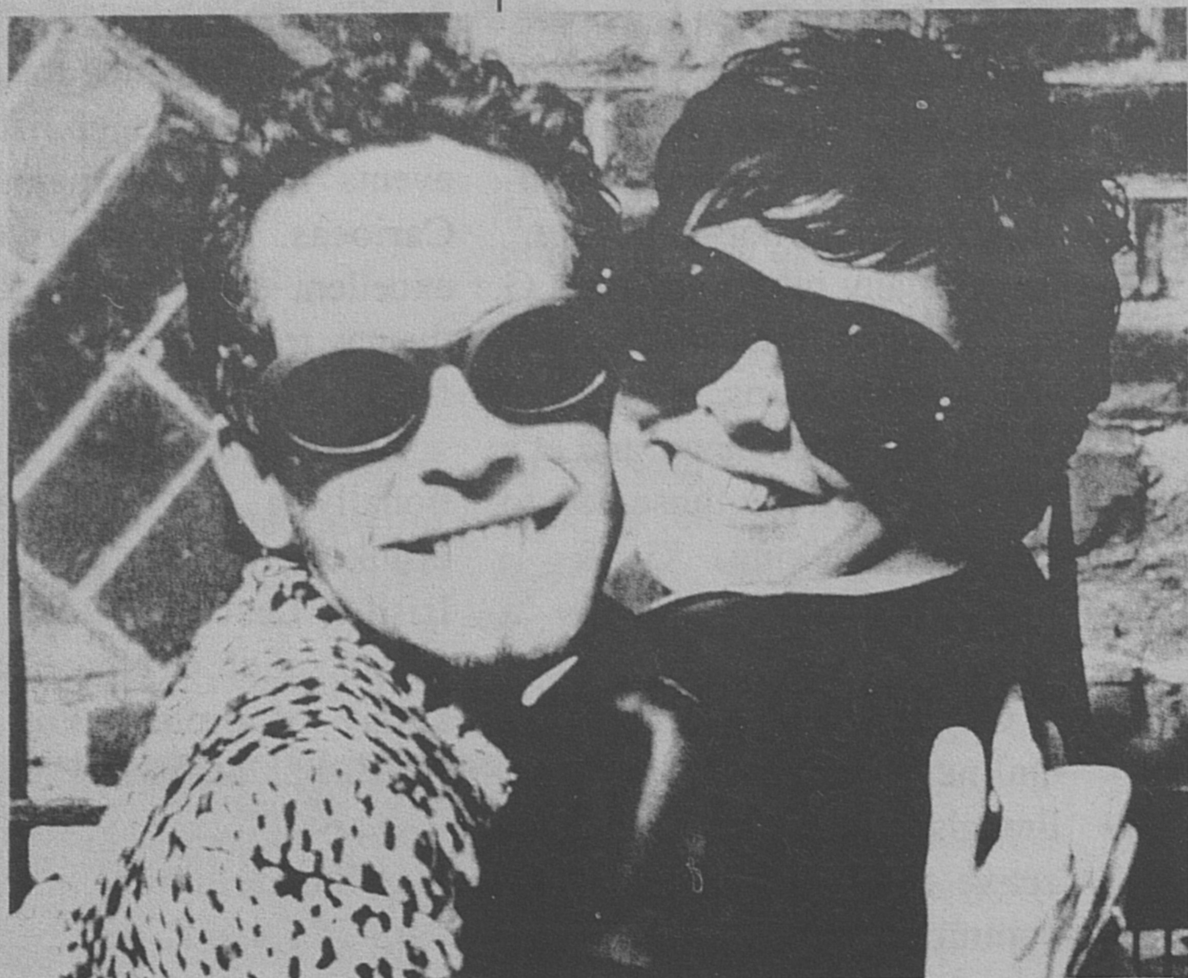
Tom Hollander and Julie Graham in Bedrooms & Hallways , playing at the Green Mountain Film Festival