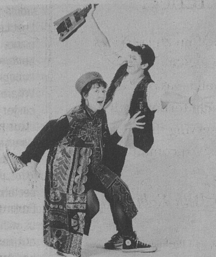
THE THERAPY SISTERS