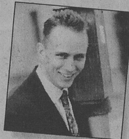
Find just who you're looking for with ManFinder®

It's like meeting the man of your dreams while you're still awake.