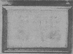
"The mandelsdorffian tripartite theory of corn genetics" is on display in the permanent collection at the Main Street Museum in Hartford Village, VT