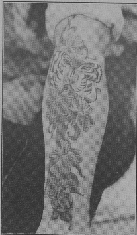
Tattoo by Jim Thibault. This tattoo is a cover-up of other tattoos.

Tattooing should never be considered anything less than permanent. But with the right combination of art and artist, it's a work of art that can be worn with pride. ▼