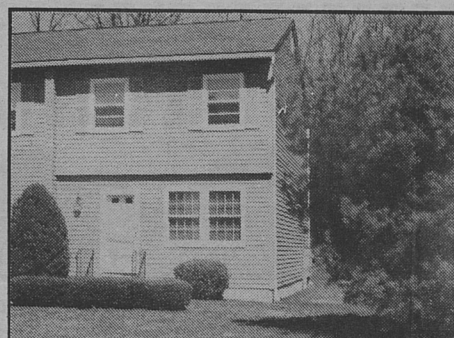
Woodlins, Colchester Townhouse, end unit $85,900