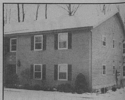
Pheasant Woods, Colchester 1200 square foot with fireplace $87,500

Proudly serving our community since 1981