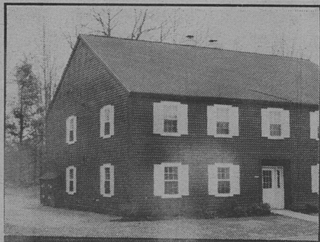
Twin Oaks, So. Burlington 2 Bedroom, end unit $66,900