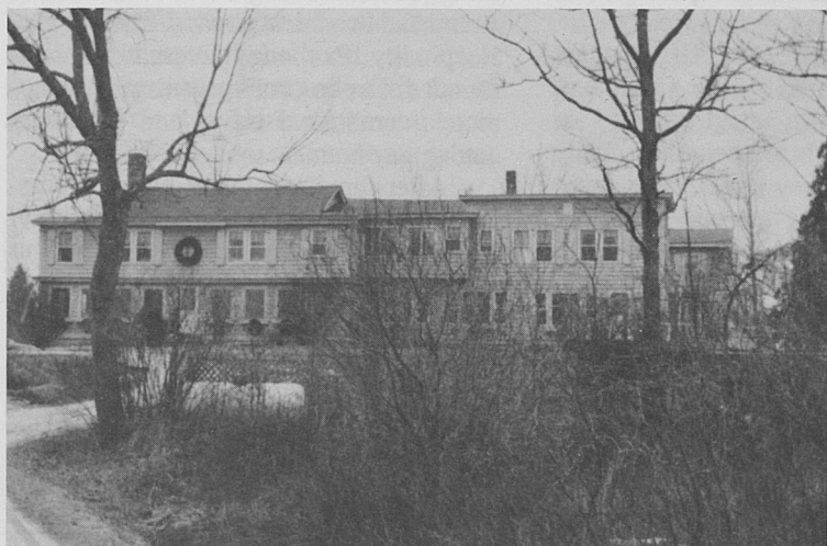
Joining ceremonies, quilting bees, and eventually a lesbian singles weekend: all part of the regular calendar of events at the Highlands Inn