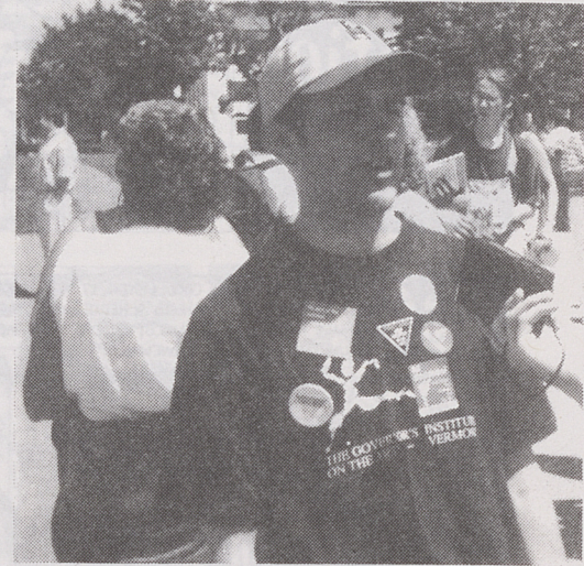
Doug Racine -- (not pictured) Former Vermont Senator and candidate for Lieutenant Governor

"I think it's exactly what you called it - it's Gay Pride. It's like, 'The hell with you shouting at me and calling me names. I can use this park. I can march on those streets'...I really respect the fact that you're the ones who are really sending the message because you do go out and you march... I respect that, I really do."