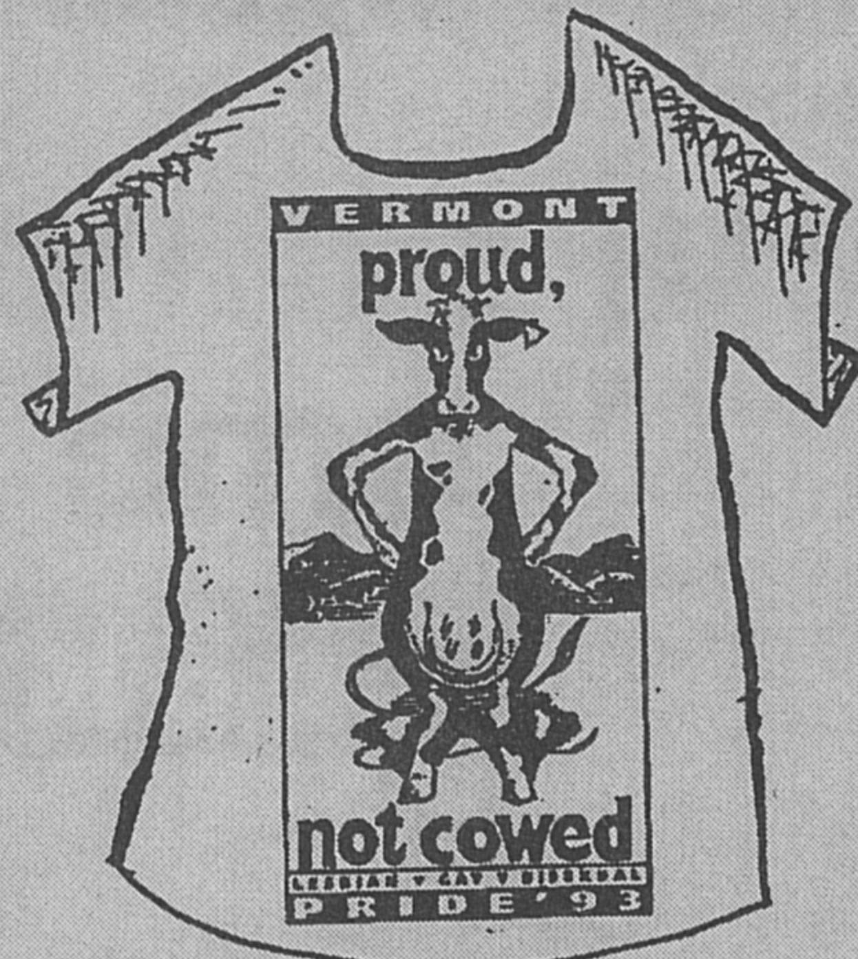
Designed by Alison Bechdel

Vermont Pride Day festivities will be June 26th in Burlington. Plan a float, or contingent. Join the marching band. Get involved! Call 802-862-6764 for more info.