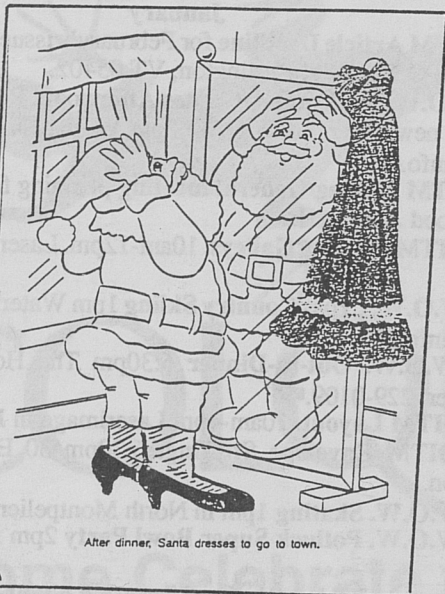
After dinner, Santa dresses to go to town.

It's time for PEARLS' SEVENTH CHRISTMAS PARTY