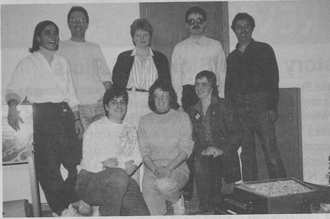
The Out in the Mountains Staff...