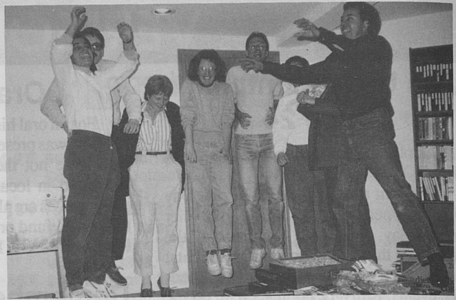
...Celebrating their upcoming 2 month Vacation!