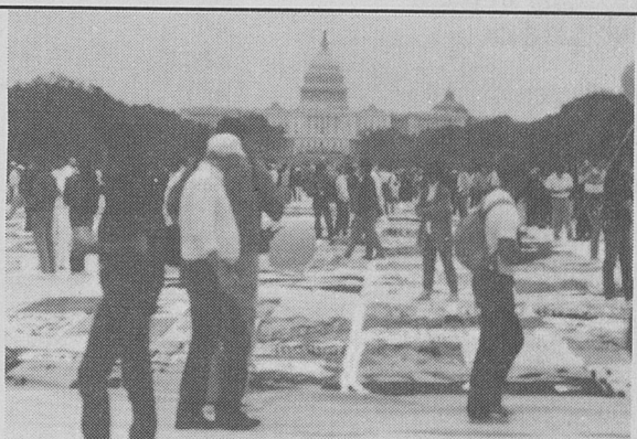
More MOW pictures. Try to remember that time in October!