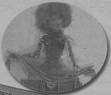
THE DIALOGUES PROJECT

Allen House Room 204, 5pm-7pm A gathering of graduate students with free food and great conversation. Sponsored by: LGBTQA Services