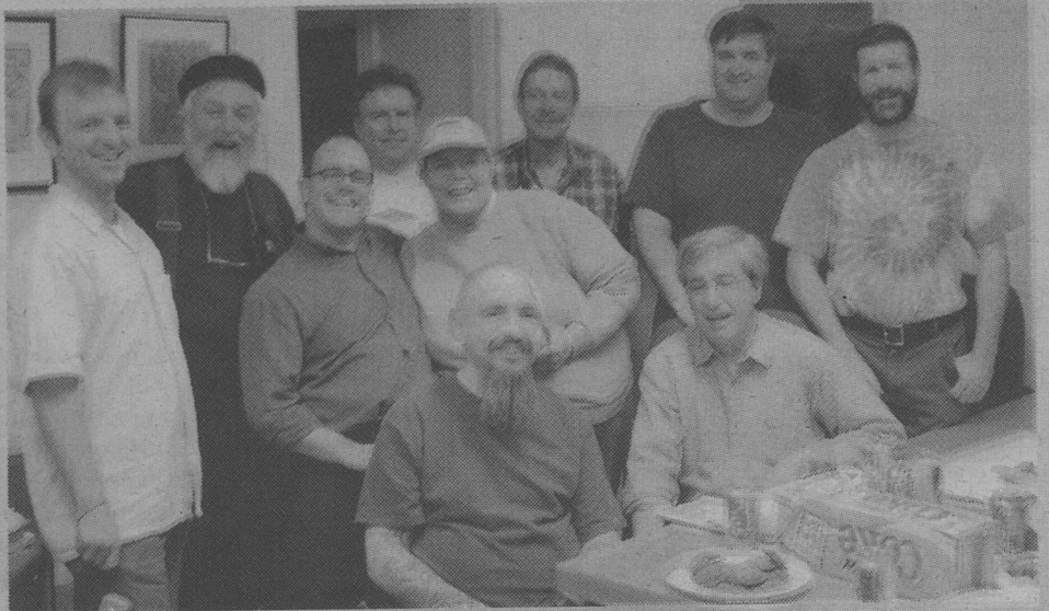
Thanks to the gang at OITM stuffing night (photo taken this spring).

out in the mountains mountainpridemediaweb.org