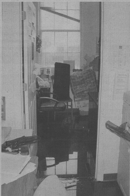
Water from flood reflects on floor of SafeSpace offices in March.

"Also, SafeSpace staff would like to thank R.U.1.2? for allowing SafeSpace to use office space at the Center," Beal added. ▼