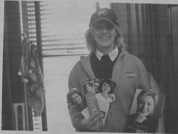
The gift shop at National First Ladies' Library Education and Research Center

Akron's Carousel Dinner Theatre was the evening event with "Swing" being the show. I suppose that the show did a run on Broadway and missed it. Okay, it did and was a Tony nominee as well. Loved it here. The show highlights over 30 dance sequences with a swing dance band backing it up. Some comedy too. The food was pretty good for a "getting it out to a large audience all at once thing". You're paying about $12 more for dinner than if you just see the show and if you don't care for what's included on the menu, you can always pay extra for something else. "I Love You, You're Perfect. Now