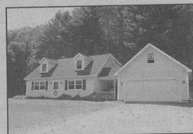
•Underhill •3 Bedroom •Jacuzzi •$199,000