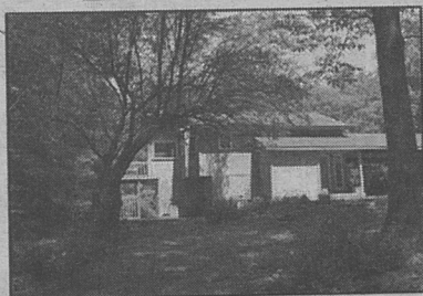
•Westford •3 Bedroom •Contemporary •$213,900