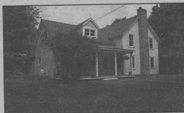
•Jericho •3 Bedroom •Vintage Farmhouse •$213,500