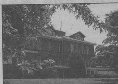
•Burlington •2 Bedroom •Adams School Condo •$629,000