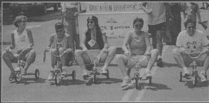
Dykes on Trykes - Pride 1999

Help us make next month's issue the best Pride issue ever.