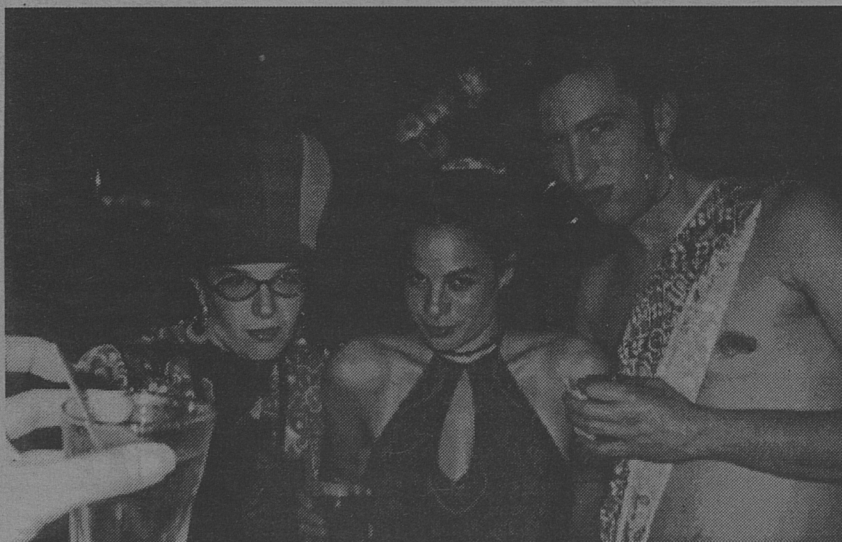
... and a final toast to the evening.